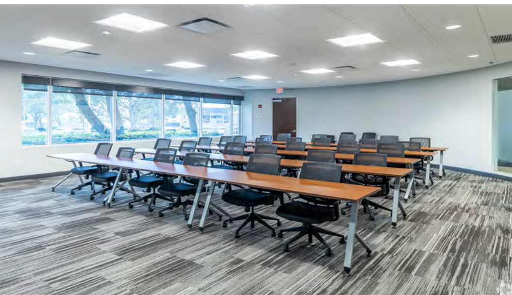
On-site state-of-the-art conference facility seats up to 40 people