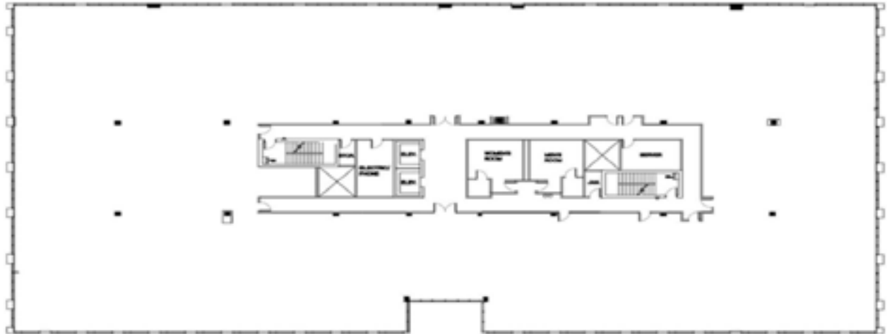
COMMERCIAL PLACE II