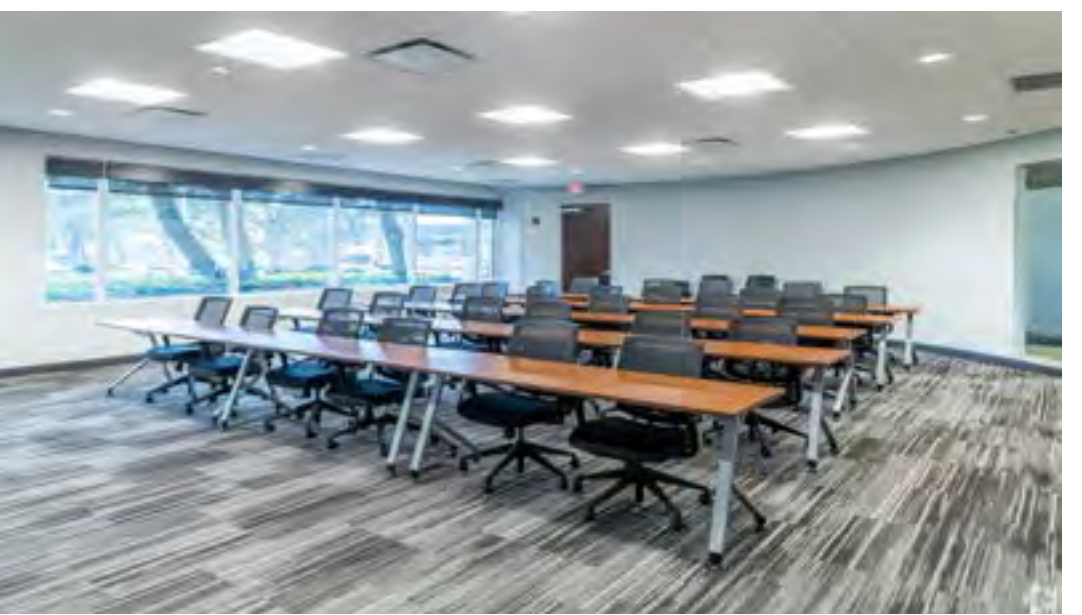
On-site state-of-the-art conference facility seats up to 40 people